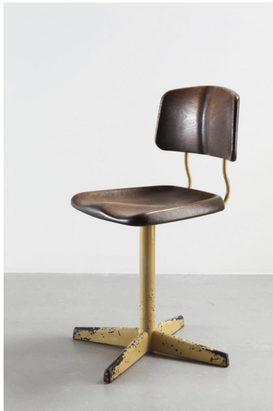
Jean Prouvé, Dactylo chair, 1944

http://www.champ-magazine.com/feature/the-constructor-jean-prouve/