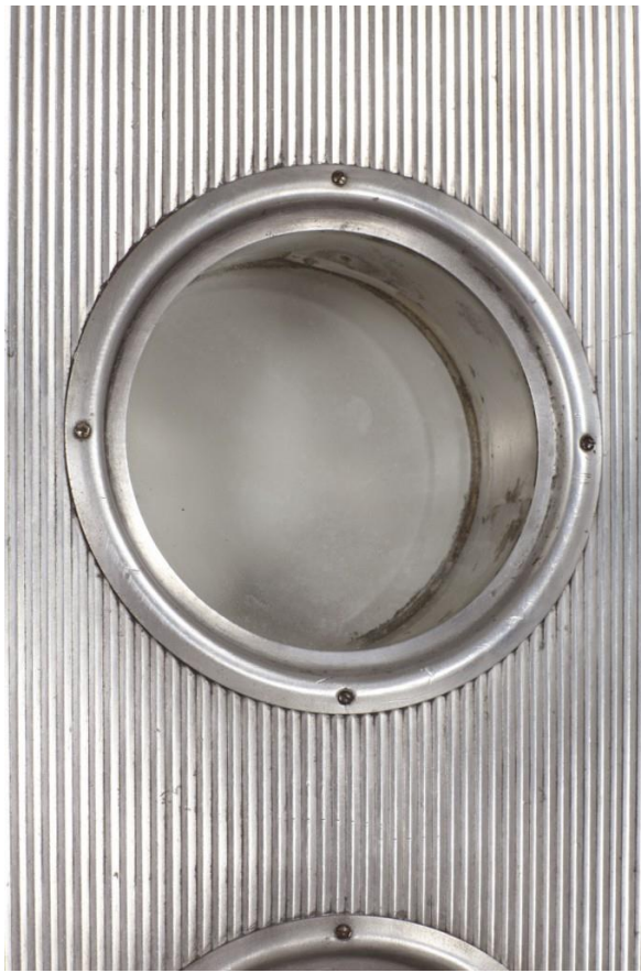
Façade panel with porthole windows, 1951 Provenance : Casino de la Grande Côte, Royan, France