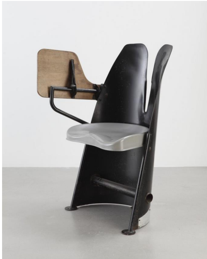
Jean Prouvé, Bergère, lecture-hall chair, 1951 Provenance : Faculté de droit, Aix-Marseille, France