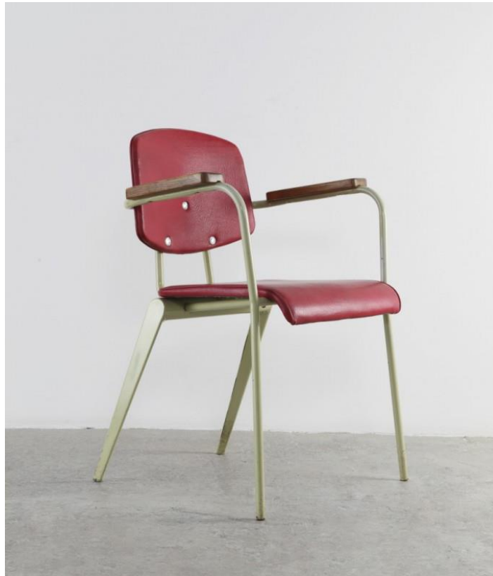
Jean Prouvé, Conférence no. 355 chair, 1954