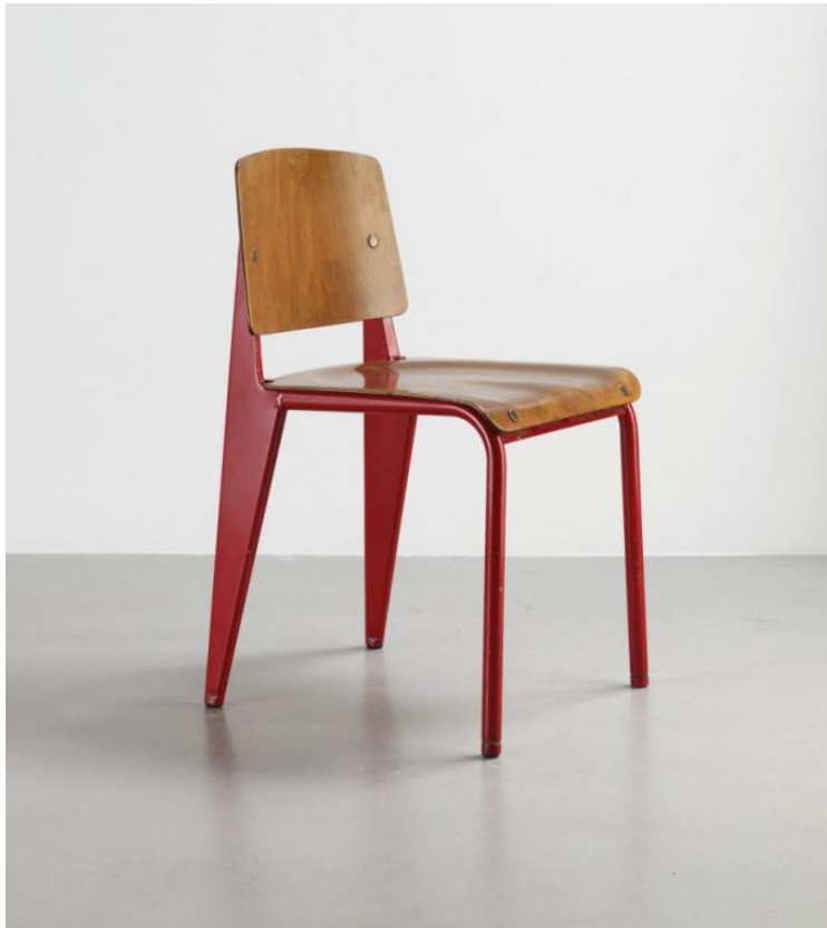
Jean Prouvé, Chair no. 4, 1934