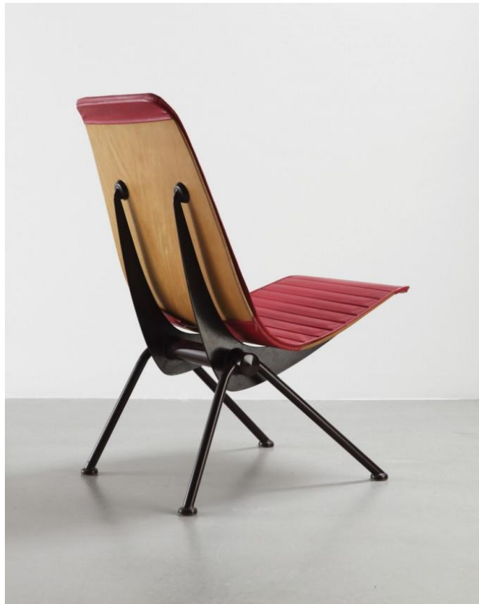
Jean Prouvé, Fauteuil léger no. 356, a.k.a. «Antony chair», version with cushioned sheath in leatherette, 1955

http://www.champ-magazine.com/feature/the-constructor-jean-prouve/