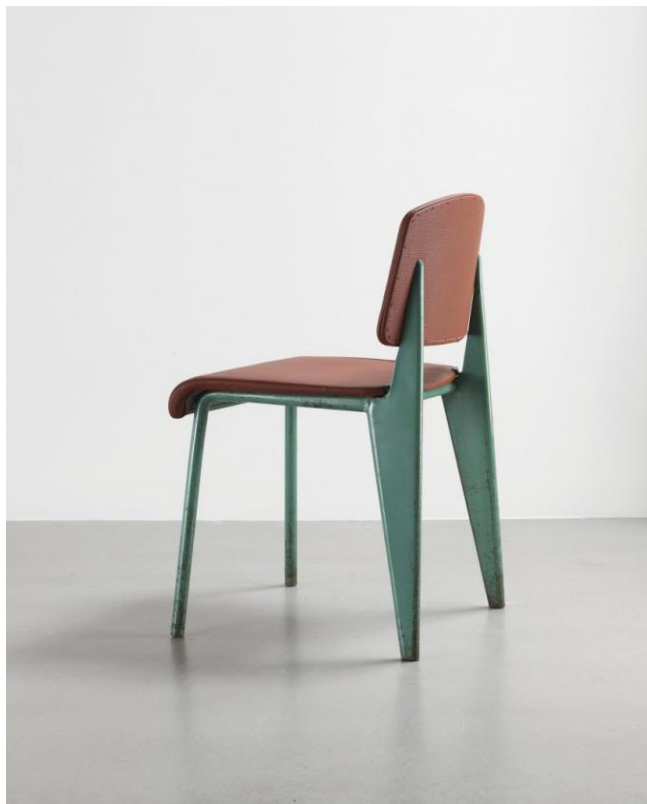
Jean Prouvé, Chair no. 4, version with cushions 1934

http://www.champ-magazine.com/feature/the-creator-jean-prouve/