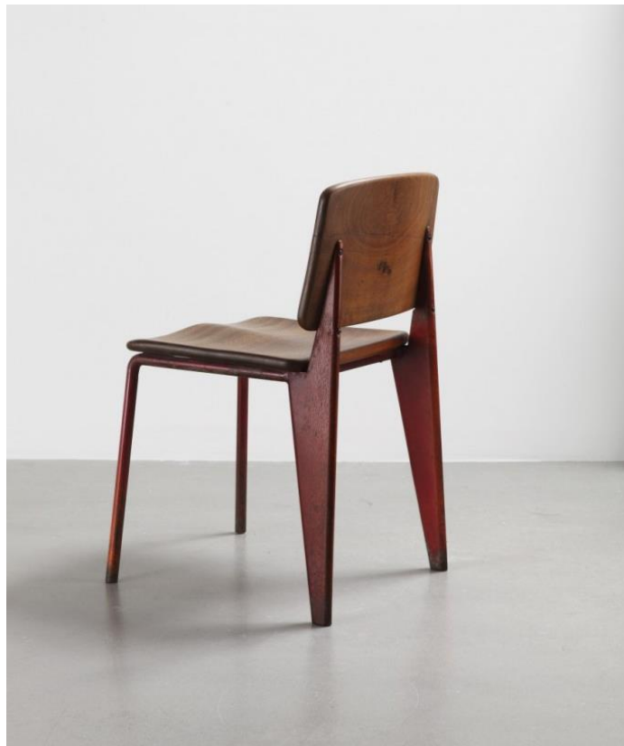
Jean Prouvé, Chair no. 4, 1934