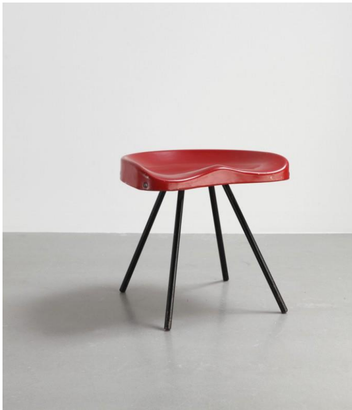
Jean Prouvé, Stool no. 307, 1951