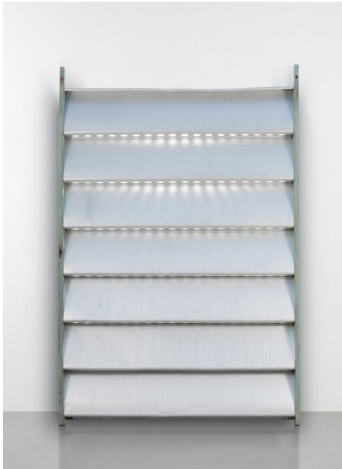
Aluminum shutter, 1957 © Galerie Patrick Seguin