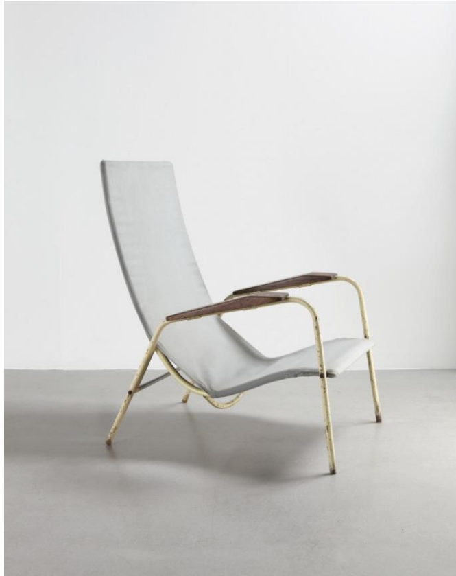
Jean Prouvé, Tropique no. 351 armchair, 1950 Provenance : Air France, Brazzaville, Congo