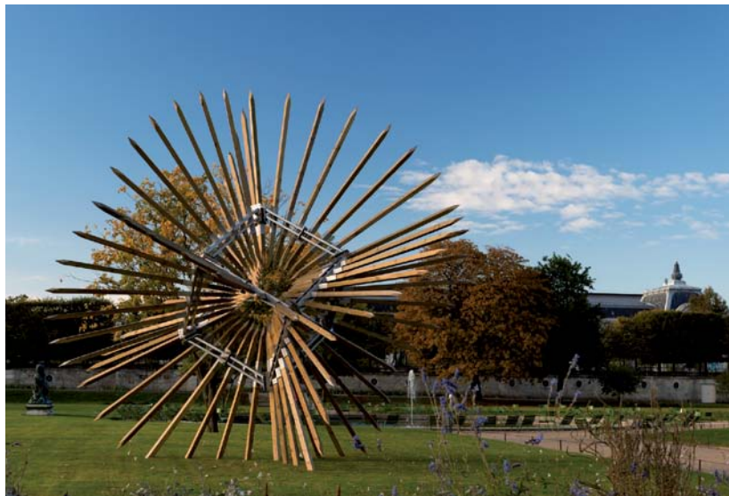
Vincent Mauger, Les injonctions paradoxales , 2016, stainless steel and wood structure, 700 x 750 x 750 cm.

This work was produced thanks to the support of the Fondation François Pinault. Courtesy Vincent Mauger and Galerie Bertrand Grimont. © Photo : Marc Domage.