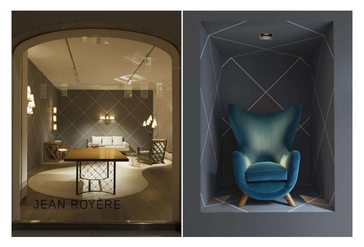
Jean Royère, view of the exhibition at Galerie Patrick Seguin