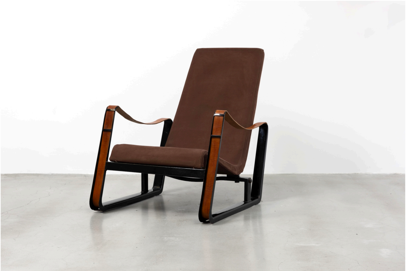
Jean Prouvé, Cité armchair, 1930