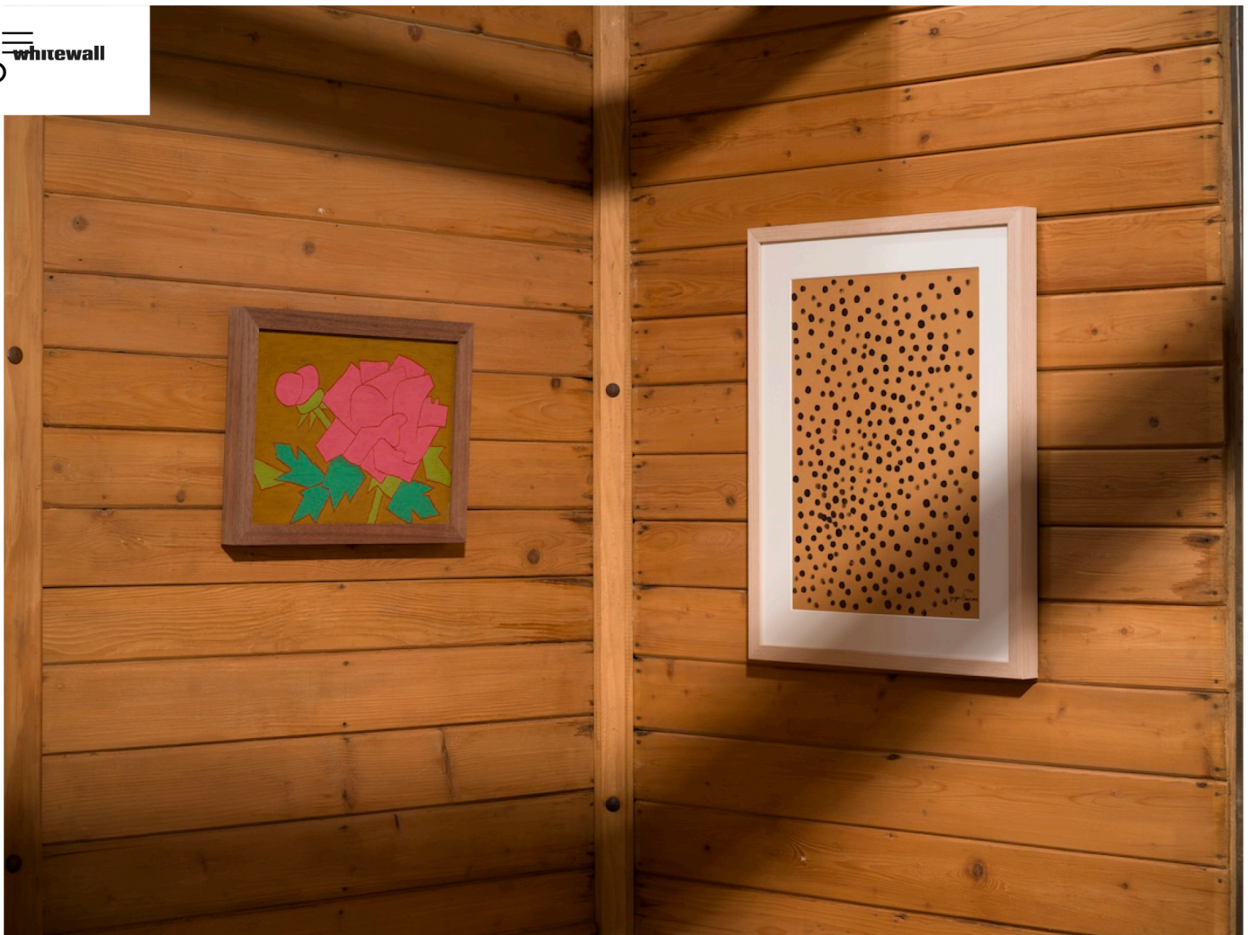
Installation view of "Modern Dreamers Iconic Art, Architecture and Design," courtesy of Art Intelligence Global.