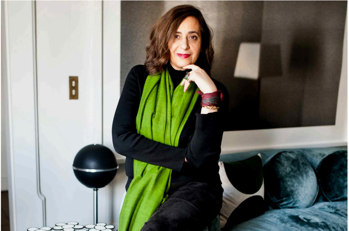
India Mahdavi at home in Paris

The architect and designer's stylish highlights in her home city