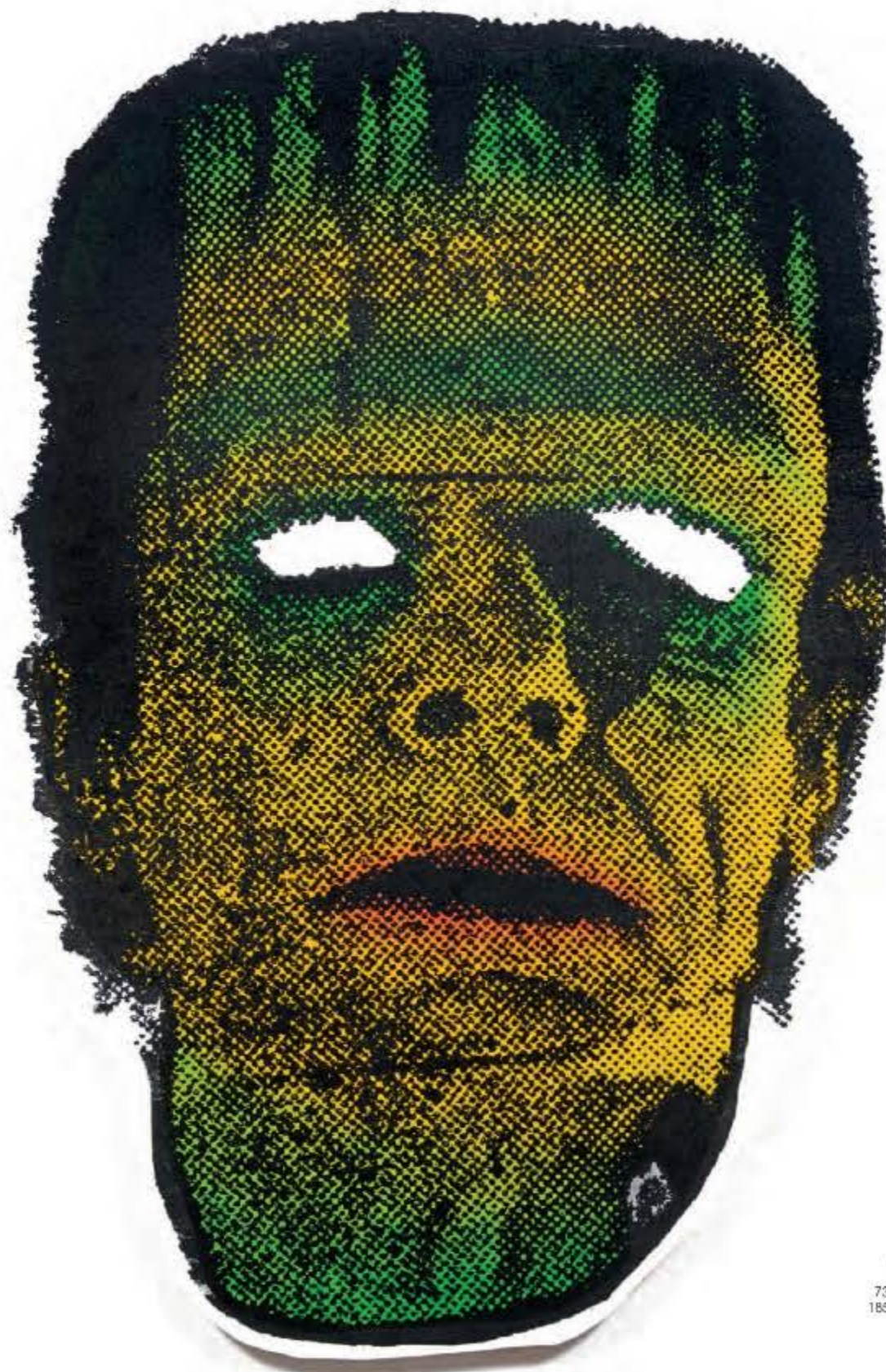
Will Boone, "Freak," 2018, acrylic on canvas over wood panel, 73 x 48 1/4 x 1 1/4 in./ 185.4 x 122.6 x 3.2 cm.