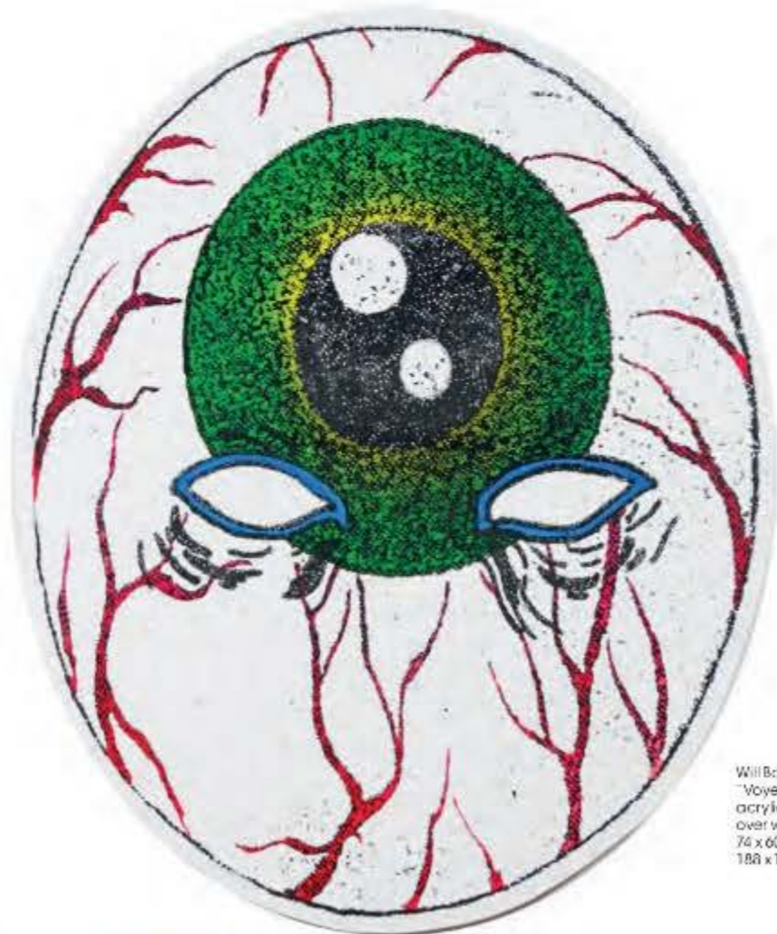
Will Boone, "Voyeur," 2018, acrylic on canvas over wood panel, 74 x 60 3/4 x 1 1/4 in./ 188 x 154.3 x 3.2 cm.