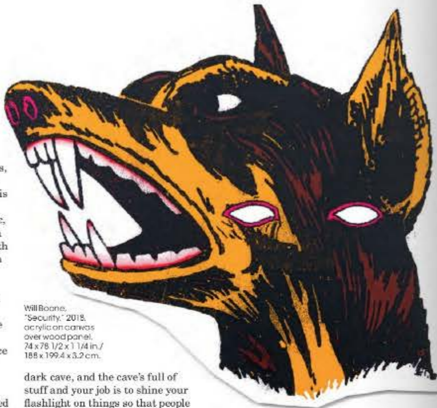
Will Boone, "Security," 2018, acrylic on canvas over wood panel, 74 x 78 1/2 x 1 1/4 in./ 188 x 199.4 x 3.2 cm.

Being an artist is sort of like if you have a flashlight and you're in a big