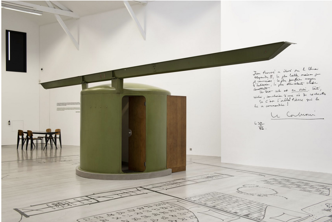
This core is the centrepiece of the exhibition at Galerie Patrick Seguin

In the winter of 1954, temperatures dropped so low that a woman and child died from the cold.