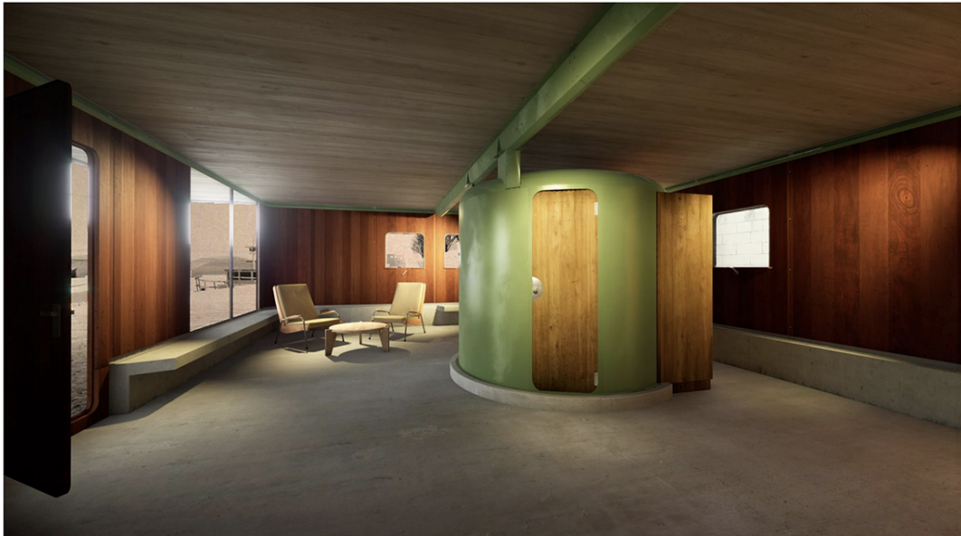
A VR headset transforms the scene into a 3D visualisation of the house