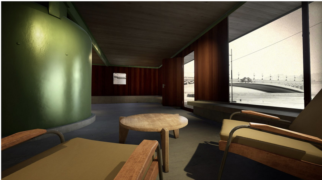
It shows the house installed on the banks of the Seine in Paris

This exhibition marks the first time the gallery has allowed a Prouvé house to be experienced in virtual reality, with a virtual experience designed by VR studio Double Geste.