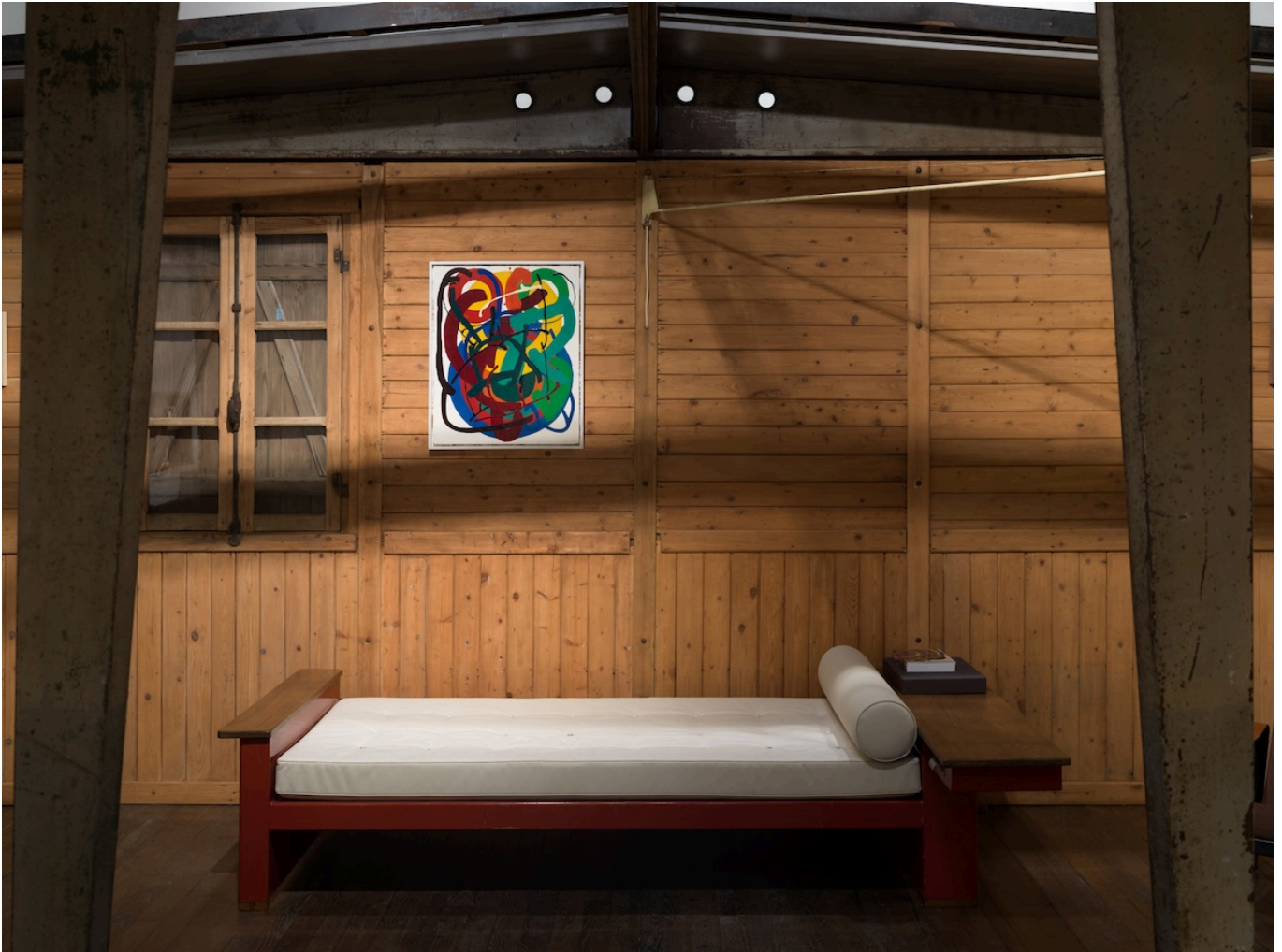
Installation view of “Modern Dreamers Iconic Art, Architecture and Design,” courtesy of Art Intelligence Global.

“Modern Dreamers: Iconic Art, Architecture and Design” features more rare architectural elements and furniture designed by Jean Prouvé. Among these is a panel with portholes from the Bouqueval demountable school in the Paris region and a selection of furniture pieces, including a few highlights: the aluminum table no. 804 , a rare prototype being exhibited for the first time; a set of S.A.M. no. 506 tables and four Métropole no. 305 chairs—all lacquered in Van Dyck brown and from the same provenance; and the Cité armchair from 1930, originally designed for classrooms at Cité Universitaire Monbois in Nancy, France. The latter was Prouvé's first piece of small-series production and remains a testament to his innovative vision.