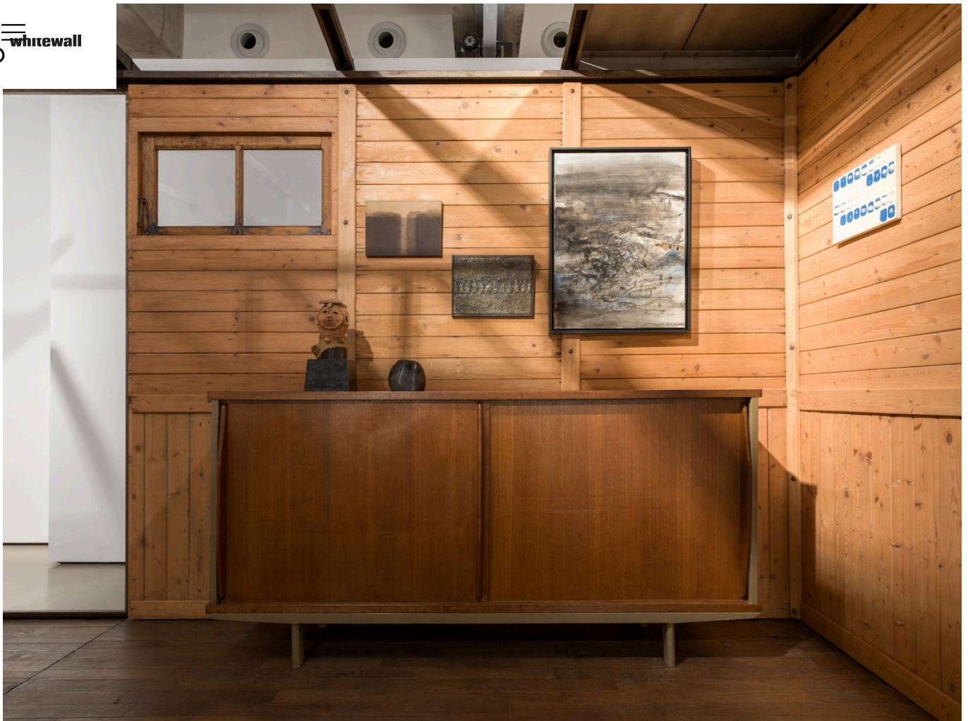
Installation view of "Modern Dreamers Iconic Art, Architecture and Design," courtesy of Art Intelligence Global.