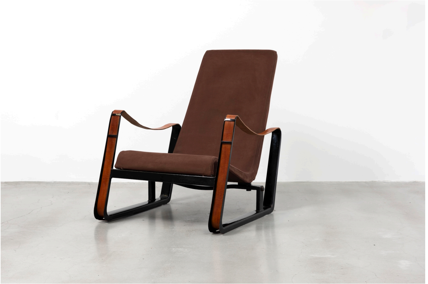
Jean Prouvé, Cité armchair, 1930