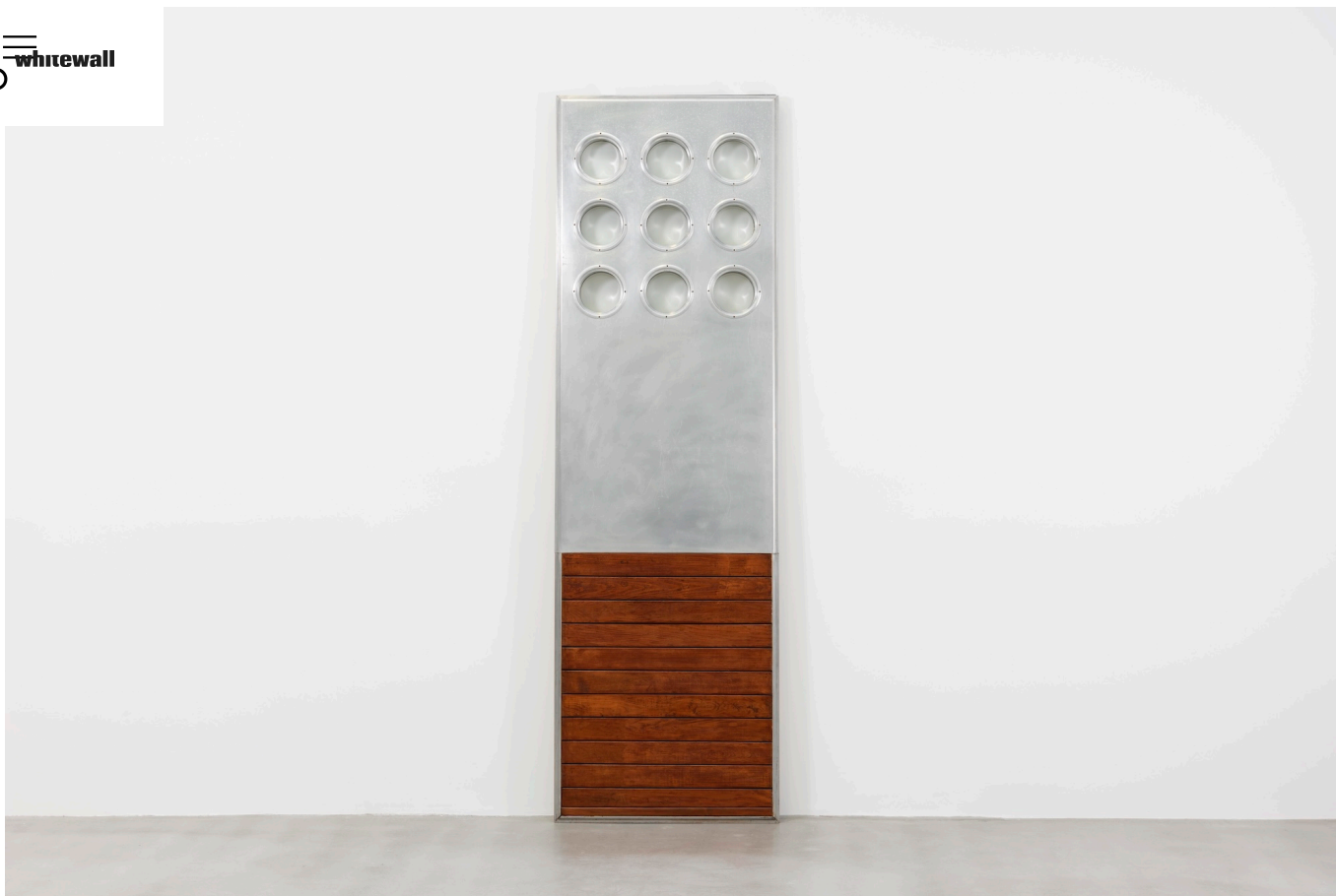
Jean Prouvé, Panel with porthole windows, 1950, © Galerie Patrick Seguin.

This exhibition marks the first unveiling of the artwork in Asia, following its acquisition by NOT A HOTEL from Galerie Patrick Seguin in a transaction facilitated by Art Intelligence Global. After the exhibition, Demountable House will be installed at NOT A HOTEL's headquarters in Tokyo.