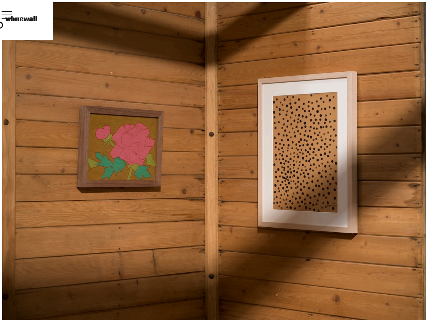
Installation view of “Modern Dreamers Iconic Art, Architecture and Design,” courtesy of Art Intelligence Global.