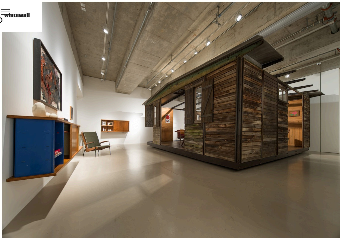
Installation view of “Modern Dreamers Iconic Art, Architecture and Design,” courtesy of Art Intelligence Global.

At the heart of the exhibition is Jean Prouvé 's 6×6 Demountable House from 1944. Originally conceived as temporary housing for displaced populations following World War II, the structure represents a convergence of form and function. Constructed from prefabricated metal and wood components for rapid assembly and disassembly, it has since become an icon of modernist design.